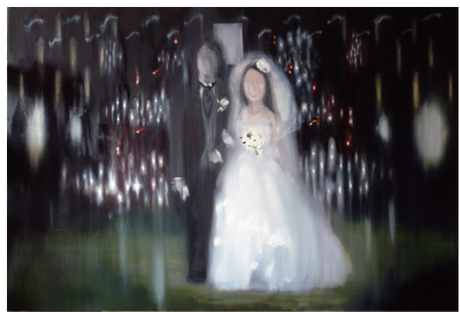
[Hello,I Love You,and Good Bye.] 2012 H1303 x W1940mm oil on canvas