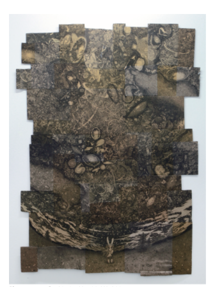
"Space caster" 2010 H1700xW1200mm Comic ink on carton