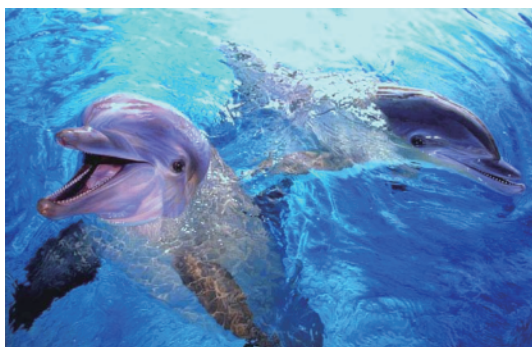
Christian Lassen "varua moana" 2004, H281 × W433mm