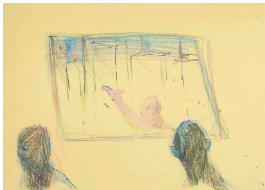
Tadayoshi YUKI "DR2011054" 2011, H110 × W140mm, colored pencil and ballpoint pen on paper