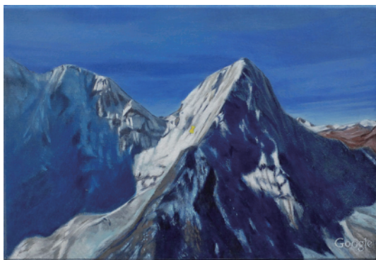
Toshio YAMAGUCHI "GEP (Google Earth Painting) -cholatsu-" 2011, H158 × W228mm, oil on canvas