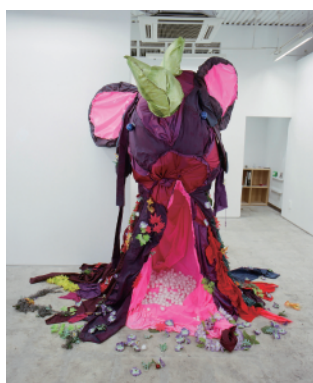
Yuukyusai "Mayoiga" 2008, variable size, mixed media

2012 Tadayoshi YUKI A Solo Show, Art Garden, Okayama