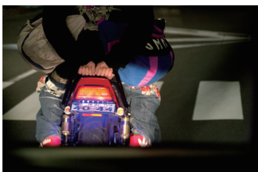
Takeshi HYAKUTO "untitled" 2012, 329 × 483mm inkjet print

2012 The Ground, Water, and Ownerless Property Core, CASHI