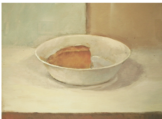
Kouichi DEAI "Seisan" 2012, H242 × W333 mm, oil on canvas