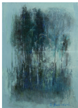
Takeo KOBAYASHI "Sugimura" 2012, H333×W242mm, oil on canvas