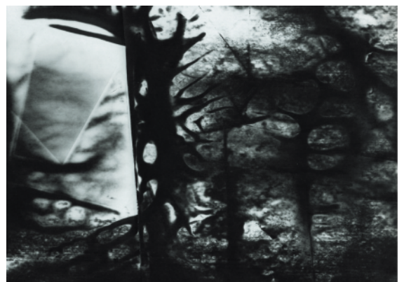
Satoshi MIYATA "thermalscape #032" 2011, Thermal paper