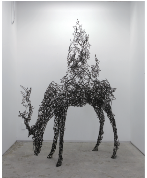
Tomohiro INABA "Poem of star" 2009, H2400xW1500xD900mm, Iron

Because we are surrounded by a flood of colors and information saturation in our society, we tend to have an illusion that everything will stay there and remain the same for good. Their work, as sturdy and fragile as residual image, will tell us how precious it is to share every moment in which we live.