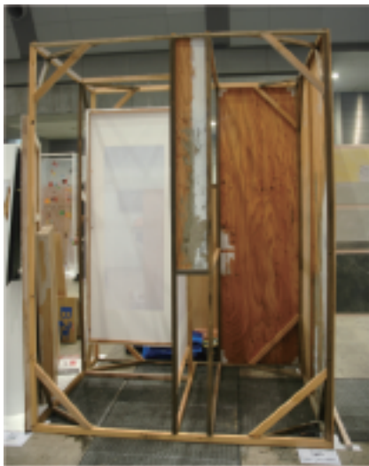
<1800.1200.2400> 2008 wood, fusible interlining (cloth), gesso, cement GEISAI#11 Marc Olivier Waller Award

2008 "GEISAI#11" Marc Olivier Waller Award