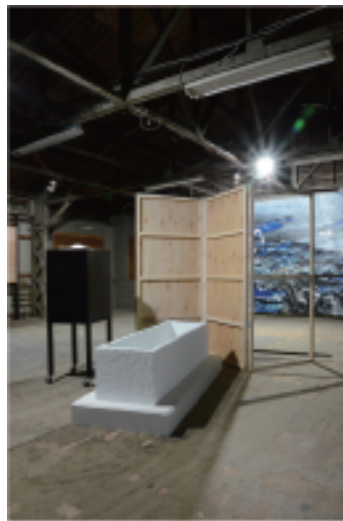
behind 《Untitled》 2013 wood, mortar, wire front 《Untitled》 2013 lacquer, soap, foamed sterol on wood