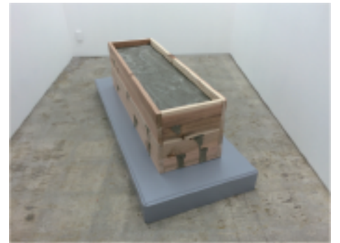
《Untitled》 2015 wood, cement