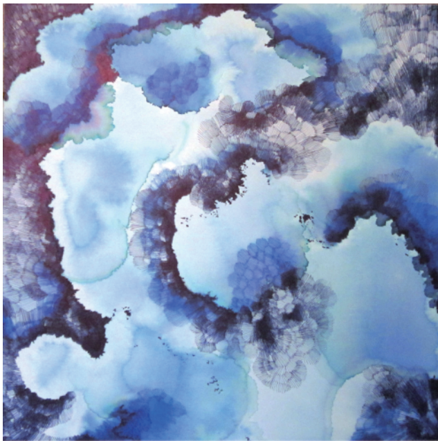
«Syubun (autumnal equinox)» 2014, H410 x W410mm, pen on paper