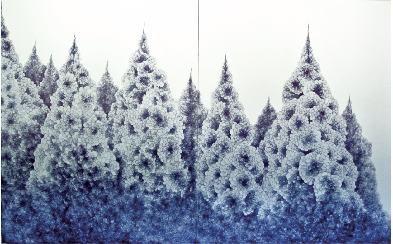
«North flora» 2013, H1000x W1660mm, pen on paper